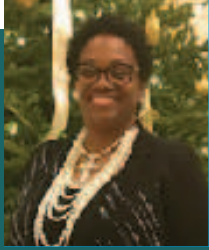
Beverly Manigo Administrators' Academy # 1778 Standards for Prof. Learn: 2, 4, 5 Domains: 2, 4